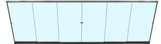
Completely closed system