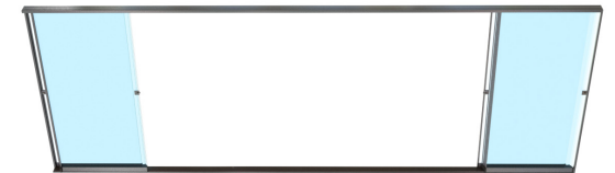
Opening on both sides